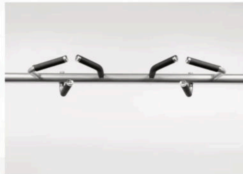
Multi Grip Pull Up Handle Grips Made of a durable urethane composite.