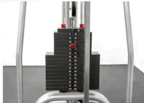
2x 220LB Weight Stacks