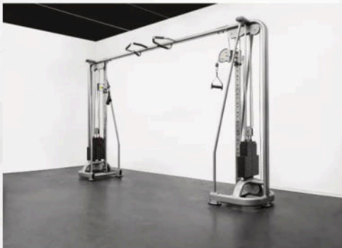
Main Frame Uses High Strength 4" x 2" x 0.12" Oval Pipes.