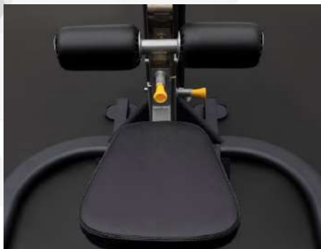
Lat Pulldown Seat