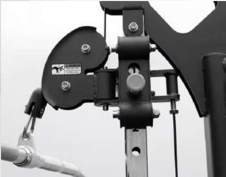
15 Adjustment Points