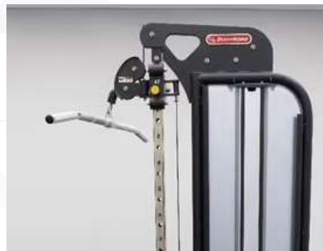
Multiple Attachments Can be used on the machine (leg extension seat not included)