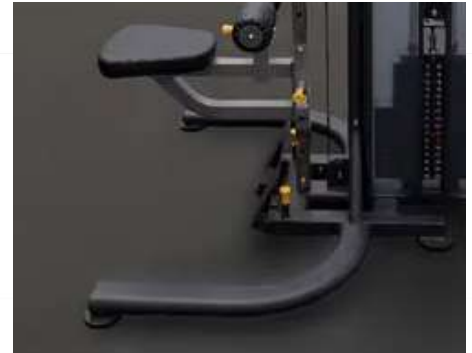
Wide Base For stability and safety.