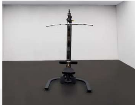
Narrow Sleek Design For maximum space saving (fits into a corner).